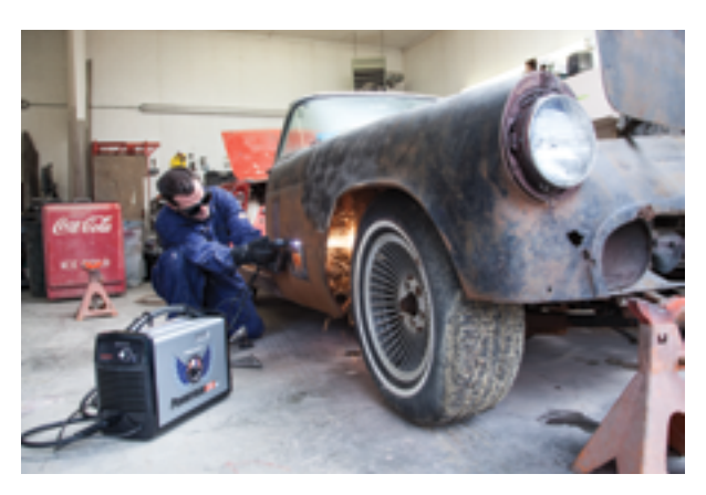
Vehicle repair and modification